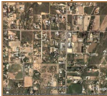
Palen & Escondido Cyn Rd $195,000

Located west of the 14 Freeway and South of Escondido this 5.6 acre parcel is zoned for agricultural or residential. Great view looks right into Vasquez Rocks Park and all the way to Santa Clarita. Property has a graded pad done with permits years ago, CC&Rs and a road maintenance agreement. Development history available.