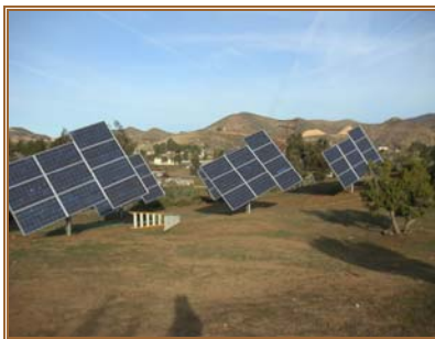
Solar panels rotate to track the Sun