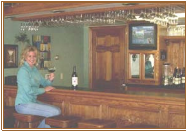
The bar at our Sweetwater Café

WOW, I can't believe the response to last month's $400,000 fixer upper! It just goes to show how desperate we are for affordable housing. Did you ever think that $400,000 would be considered "affordable"? Such a deal, it's already in escrow.