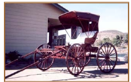
Reproduction Dr's Buggy $3,950

As seen in the Agua Dulce 2004 Wild West Days Parade! Like new, reproduction Dr's Buggy complete with harness. Excellent condition only had a horse in it once. Perfect for romantic moonlit rides through the Vineyard or just displaying on your front porch. Original cost $8,500.00. Call 661 618-3922 for more information.