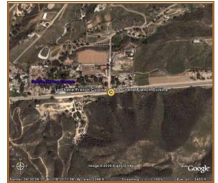
Sierra Highway, Agua Dulce $2,800,000

Located west of the 14 Freeway and South of Escondido this 5.6 acre parcel is zoned for agricultural or residential. Great view looks right into Vasquez Rocks Park and all the way to Santa Clarita. Property has a graded pad done with permits years ago, CC&Rs and a road maintenance agreement. Development history available.