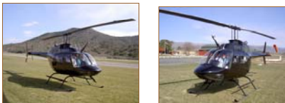
Spears Bell OH58 Helicopter

Recently I needed to get a couple of aerial photos of an estate here in Agua Dulce I'm getting ready to