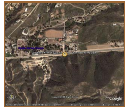
Sierra Highway, Agua Dulce $2,800,000

Located west of the 14 Freeway and South of Escondido this 5.6 acre parcel is zoned for agricultural or residential. Great view looks right into Vasquez Rocks Park and all the way to Santa Clarita. Property has a graded pad done with permits years ago, CC&Rs and a road maintenance agreement. Development history available.