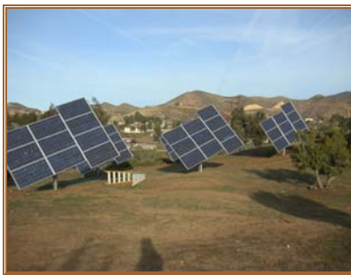
Solar panels rotate to track the Sun