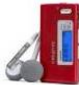
Creative, Zen Nano Plus MP3 player.

Here's how it works: you sign up at audible.com , there's no fee to join and you get a $100.00 credit towards your player. I picked the one my sister has, the Creative, Zen Nano Plus MP3 player.