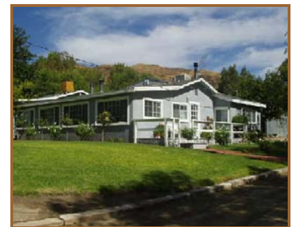
14715 Wright Rd $799,000

ATTENTION INVESTORS!! 236 acres comprised of 4 parcels, two 40 acres, one 80, and one 76 acre parcel all included. Property starts north of Le Chene Restaurant on right-hand side and fronts Sierra Highway over the hill to the Larwin Tract. With incredible views, land is a combination of flat, hillside and hilltop. Just waiting for you to develop it! Let's go take a look at it.