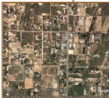
Palen & Escondido Cyn Rd $195,000

Located west of the 14 Freeway and South of Escondido this 5.6 acre parcel is zoned for agricultural or residential. Great view looks right into Vasquez Rocks Park and all the way to Santa Clarita. Property has a graded pad done with permits years ago, CC&Rs and a road maintenance agreement. Development history available.