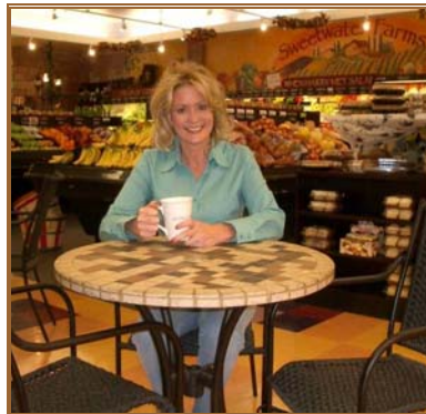
Enjoying a cup of Joe at Sweetwater Farms

Back to conveniences, you’d be amazed at what we have available here to make our life easy. I hate driving to the city, with all the noise and traffic and I like to stay here as much as possible. I also like to support our local business.